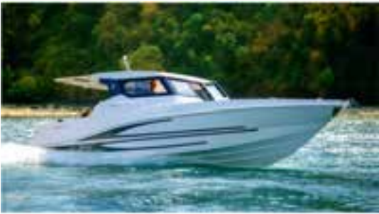
ABOVE Silvercraft 36 HT

Year after year, we're striving to exceed our customers' expectations. That's why we created the new Silvercraft sport fishing and family boats. Continuing the Gulf Craft reputation for constant innovation and superior standard of quality, the Silvercraft range combines advanced hull designs, superior performance and evolving styles.