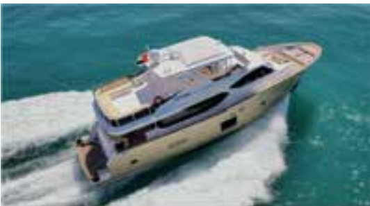
ABOVE Nomad 65

The Nomad Yachts is the latest masterpiece created by Gulf Craft. The brand Nomad Yachts was first introduced to the world in 2015 at the Dubai International Boat Show. Although a young brand, the Nomad Yachts has quickly witnessed international success when in the month following its premiere, it was debuted in Europe, Africa and Asia. The brand new line of yachts is designed for serious boating enthusiasts who are looking to take their passion onto the high seas.