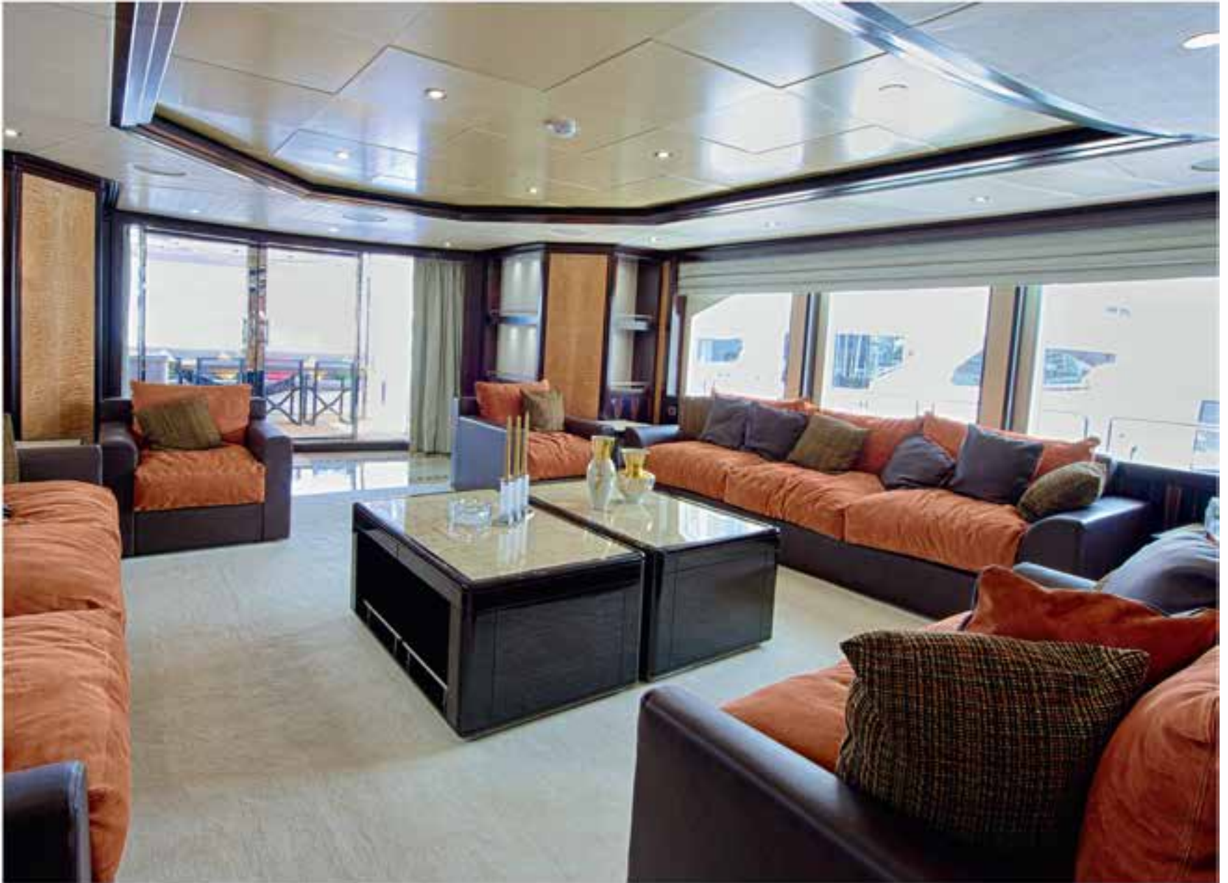
OPPOSITE Dining Area. ABOVE Main Saloon.