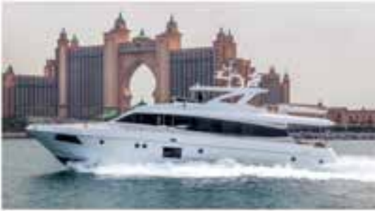
ABOVE Majesty 90