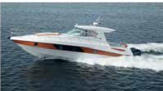
ABOVE Oryx 42

In 2006 Gulf Craft introduced the Oryx sport cruiser – the sea-borne equivalent of an elite sports car – that became an instant hit within weeks of its launch. Now the Oryx has evolved into a range of high-performance sport yachts and cruisers of different sizes that are exported worldwide.