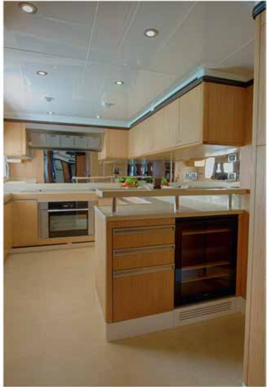
CLOCKWISE Aft Garage. Main Galley