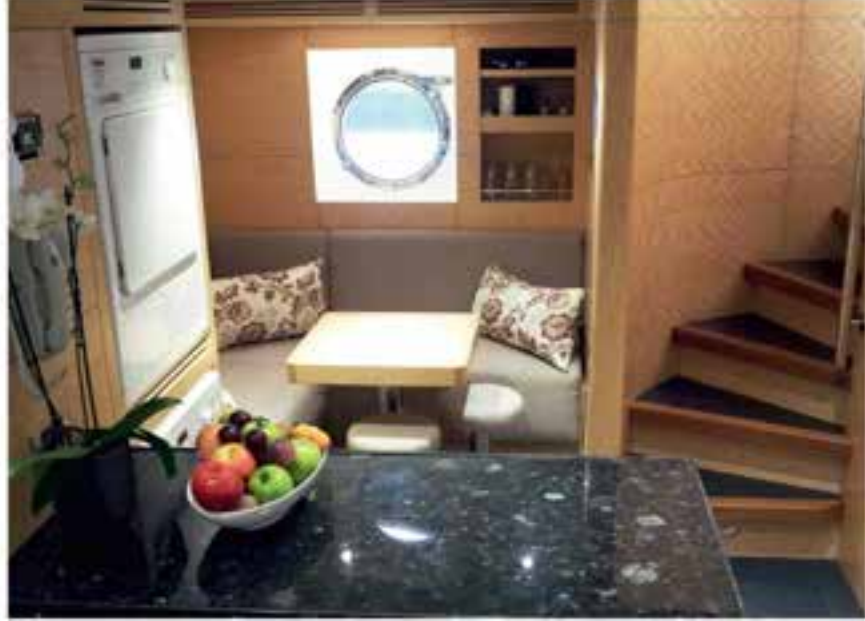
ABOVE CLOCKWISE Crew Cabin. Engine Room. Crew Main Galley.