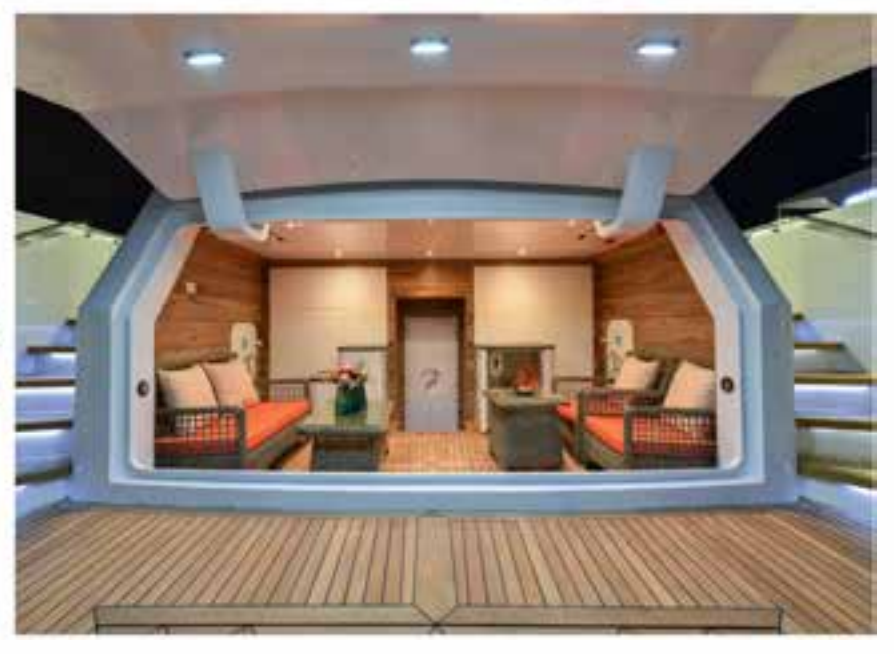
OPPOSITE Profile. ABOVE CLOCKWISE Fly-bridge. Beach Club. Bow seating area.