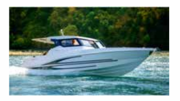
ABOVE Silvercraft 36 HT

Year after year, we're striving to exceed our customers' expectations. That's why we created the new Silvercraft sport fishing and family boats. Continuing the Gulf Craft reputation for constant innovation and superior standard of quality, the Silvercraft range combines advanced hull designs, superior performance and evolving styles.