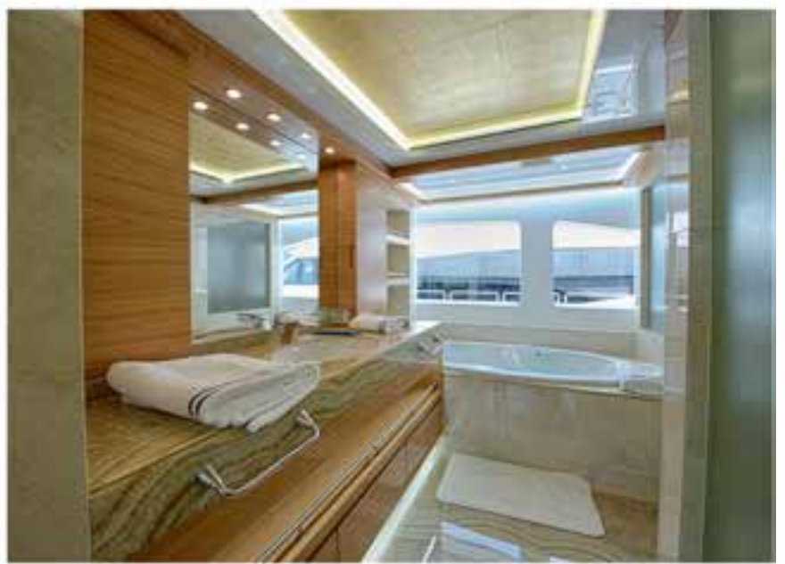
OPPOSITE Owner's Stateroom. ABOVE CLOCKWISE Owner's En Suite. Owner's Balcony.