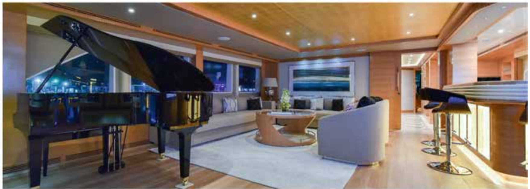
OPPOSITE Main Saloon. ABOVE CLOCKWISE Main Dining. Main Galley. Upper Deck Saloon.