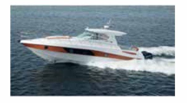
ABOVE Oryx 42

In 2006 Gulf Craft introduced the Oryx sport cruiser – the sea-borne equivalent of an elite sports car – that became an instant hit within weeks of its launch. Now the Oryx has evolved into a range of high-performance sport yachts and cruisers of different sizes that are exported worldwide.