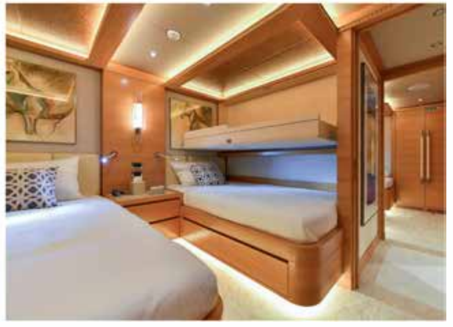
OPPOSITE Double Guest Stateroom. ABOVE CLOCKWISE Double Guest En Suite. Twin Guest Stateroom. Twin Guest En Suite.