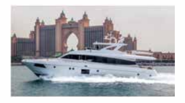
ABOVE Majesty 90