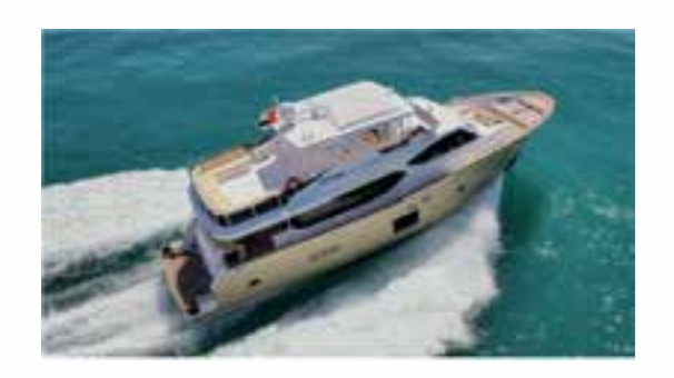
ABOVE Nomad 65

The Nomad Yachts is the latest masterpiece created by Gulf Craft. The brand Nomad Yachts was first introduced to the world in 2015 at the Dubai International Boat Show. Although a young brand, the Nomad Yachts has quickly witnessed international success when in the month following its premiere, it was debuted in Europe, Africa and Asia. The brand new line of yachts is designed for serious boating enthusiasts who are looking to take their passion onto the high seas.