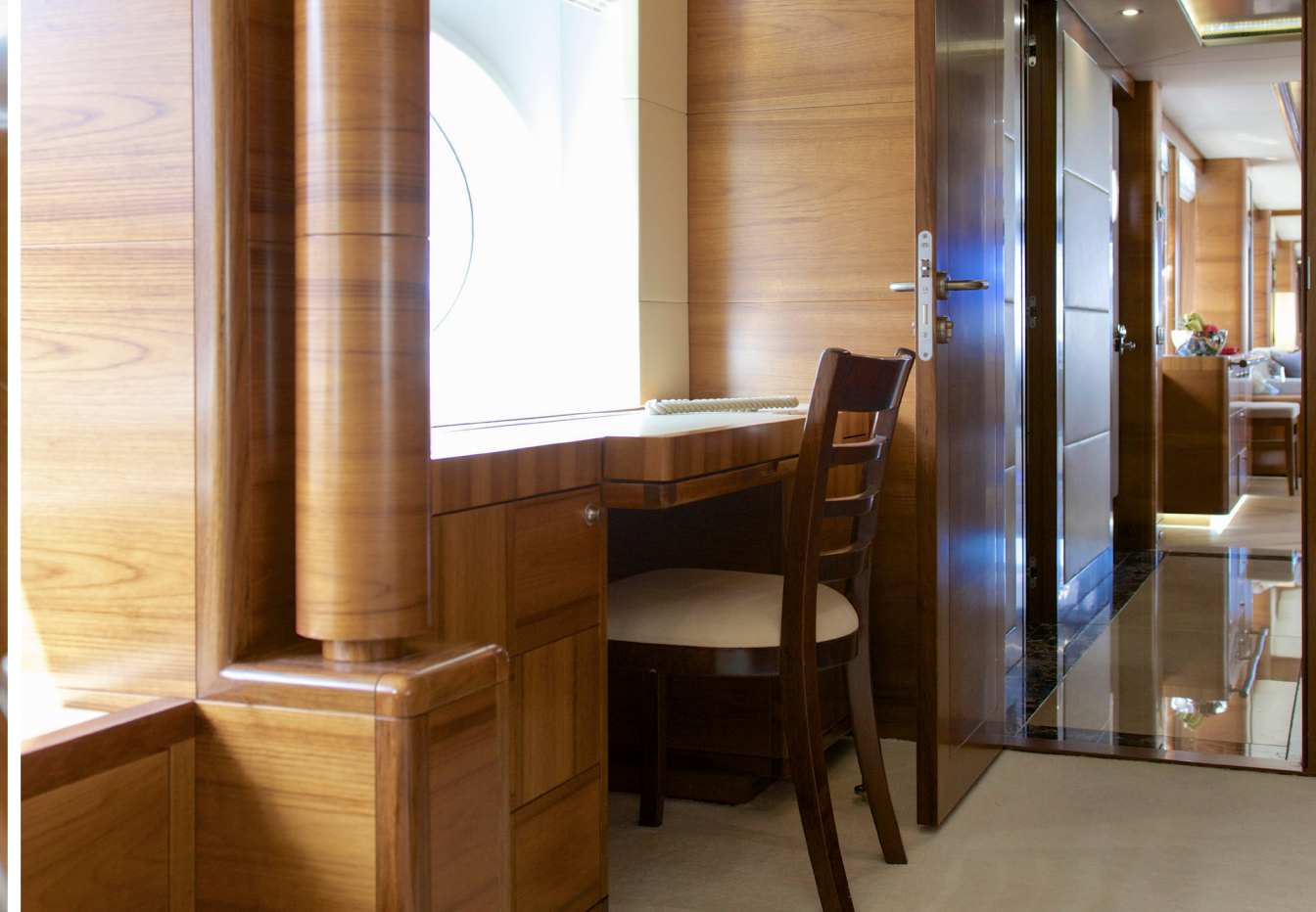
Top . Owner's En Suite | Bottom . Owner's Office