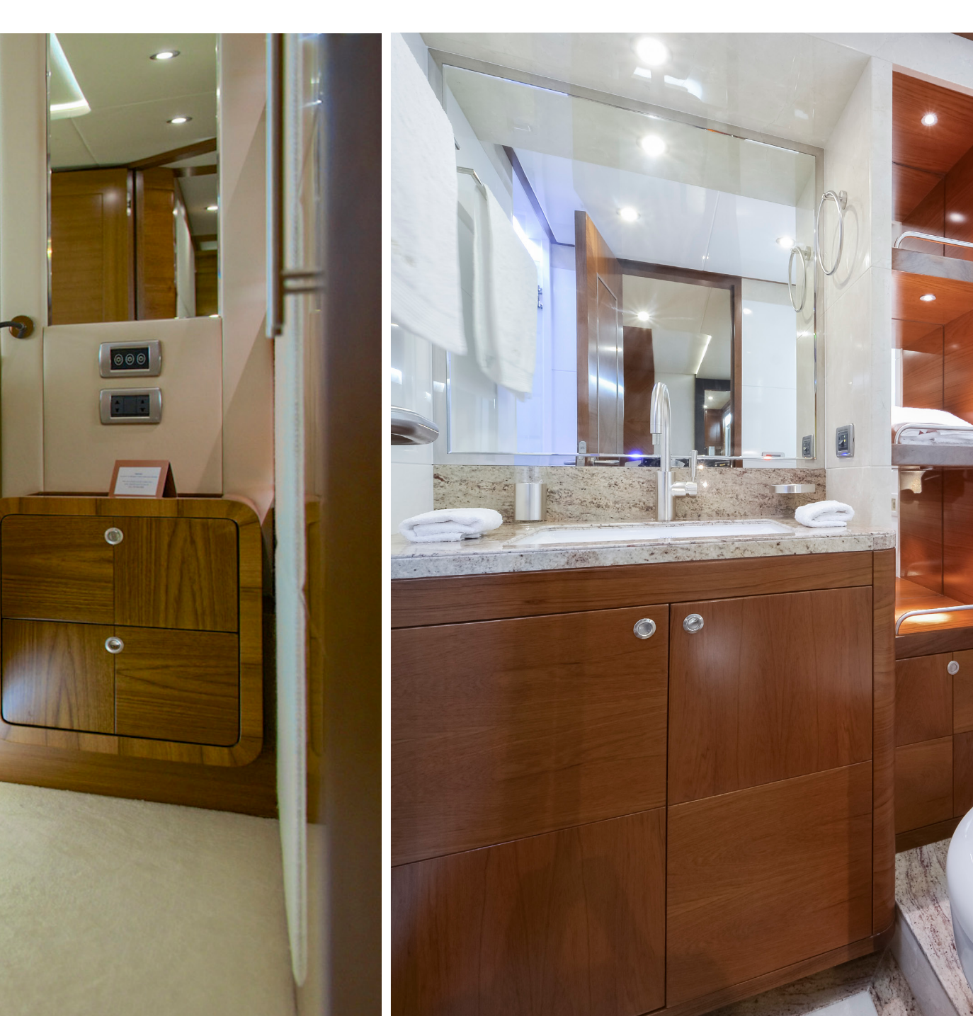
Double Guest En Suite