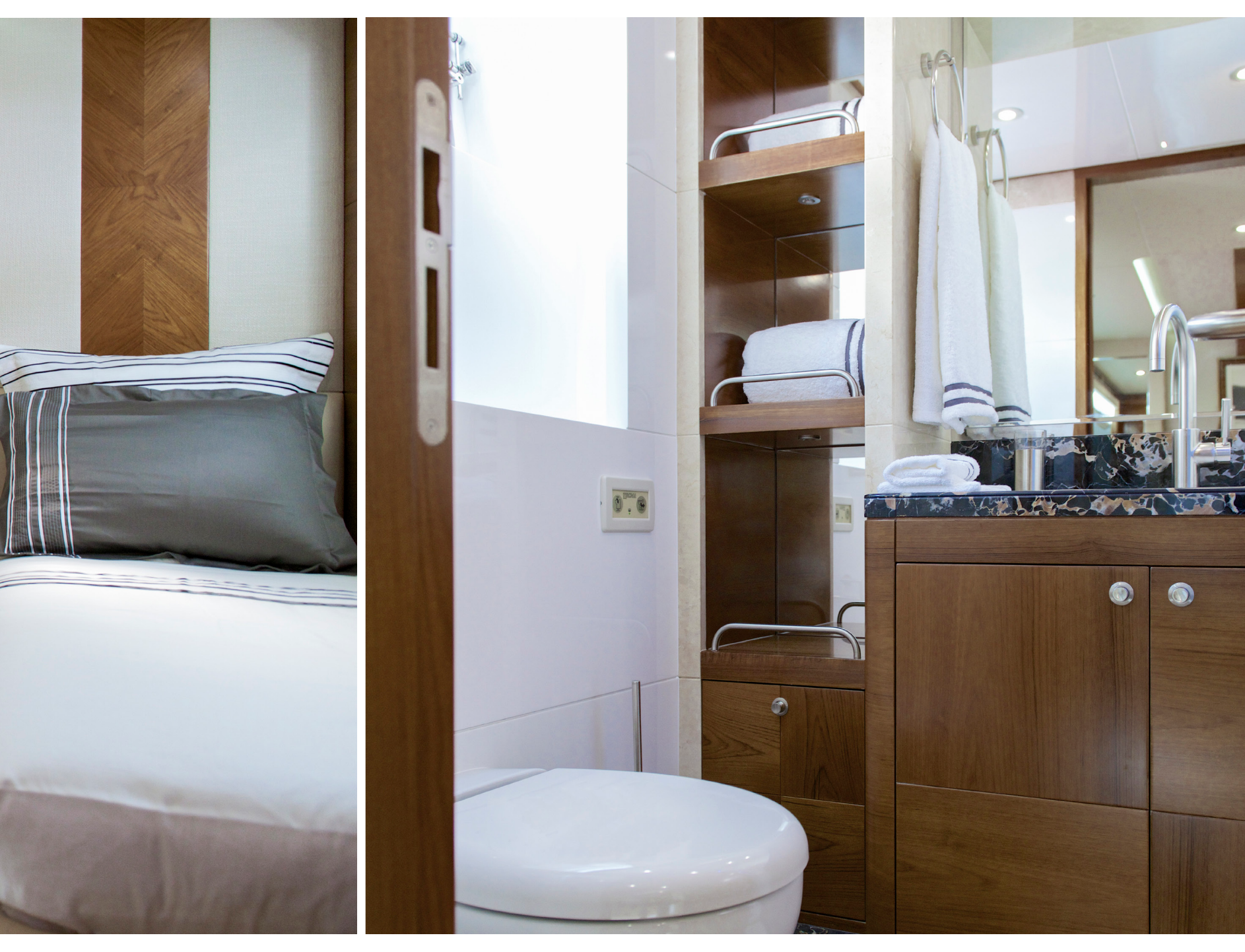
Twin Guest En Suite