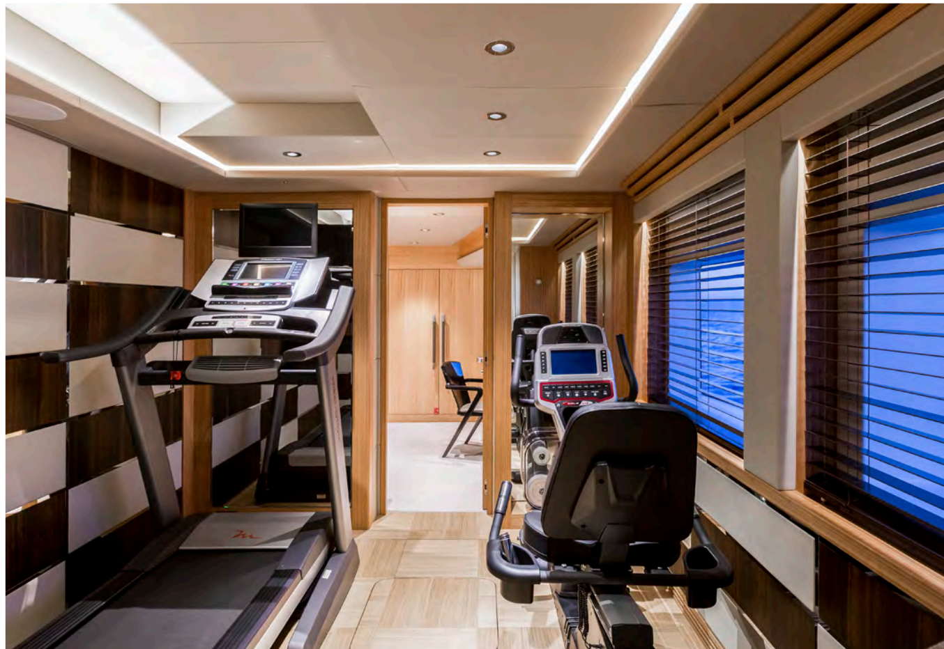
Top . VIP En Suite | Bottom . Gym