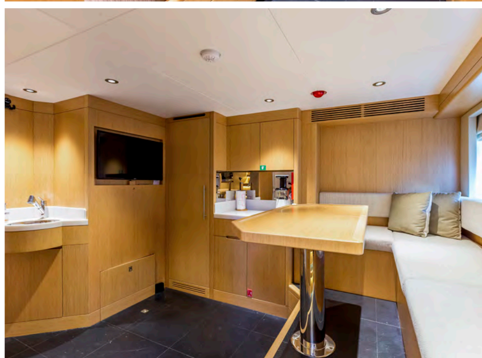
Top . Crew Cabin | Bottom . Crew Quarters