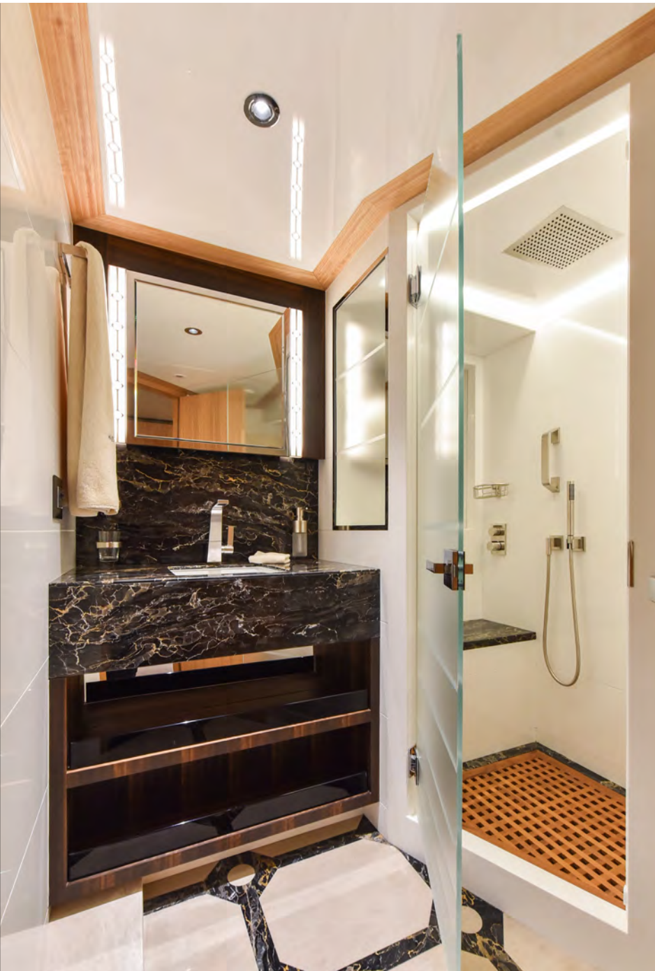
Twin Guest En Suite