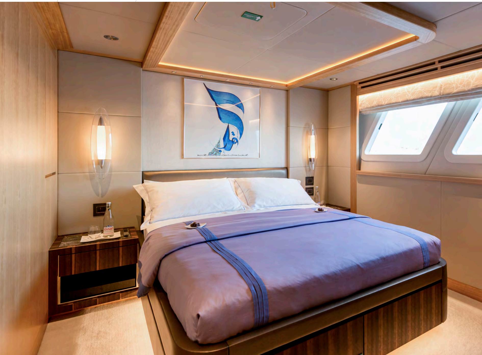
Double Guest Stateroom