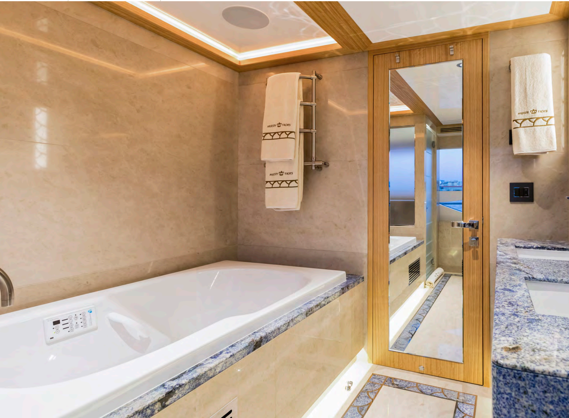
Owner's En Suite