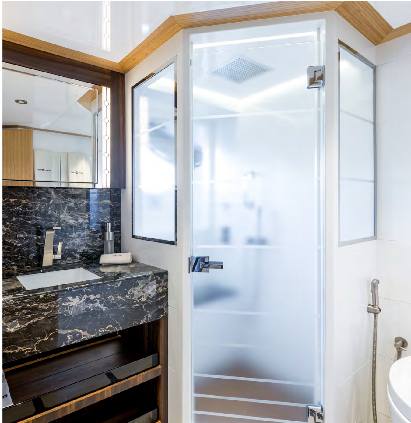
Double Guest En Suite