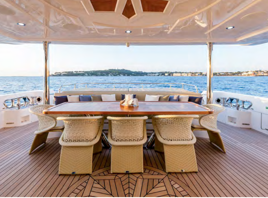
Swim Platform Cockpit Seating Area

Spend your days relaxing in the outdoor custom-made spa on the upper deck, which overlooks the endless ocean and offers first-class outdoor entertainment.