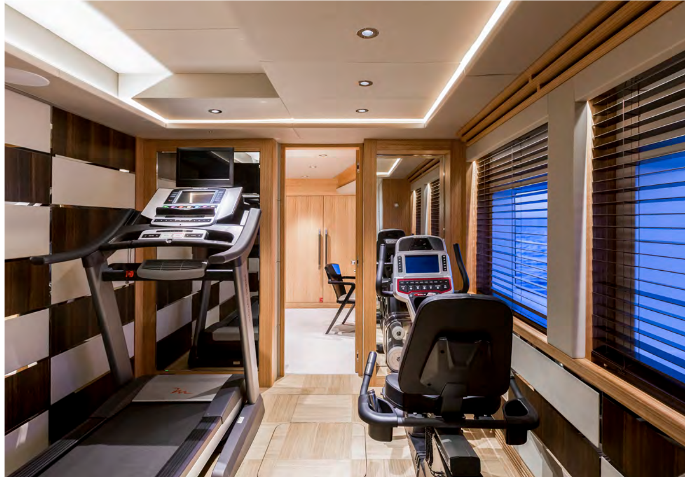
Top . VIP En Suite \,\, Bottom . Gym