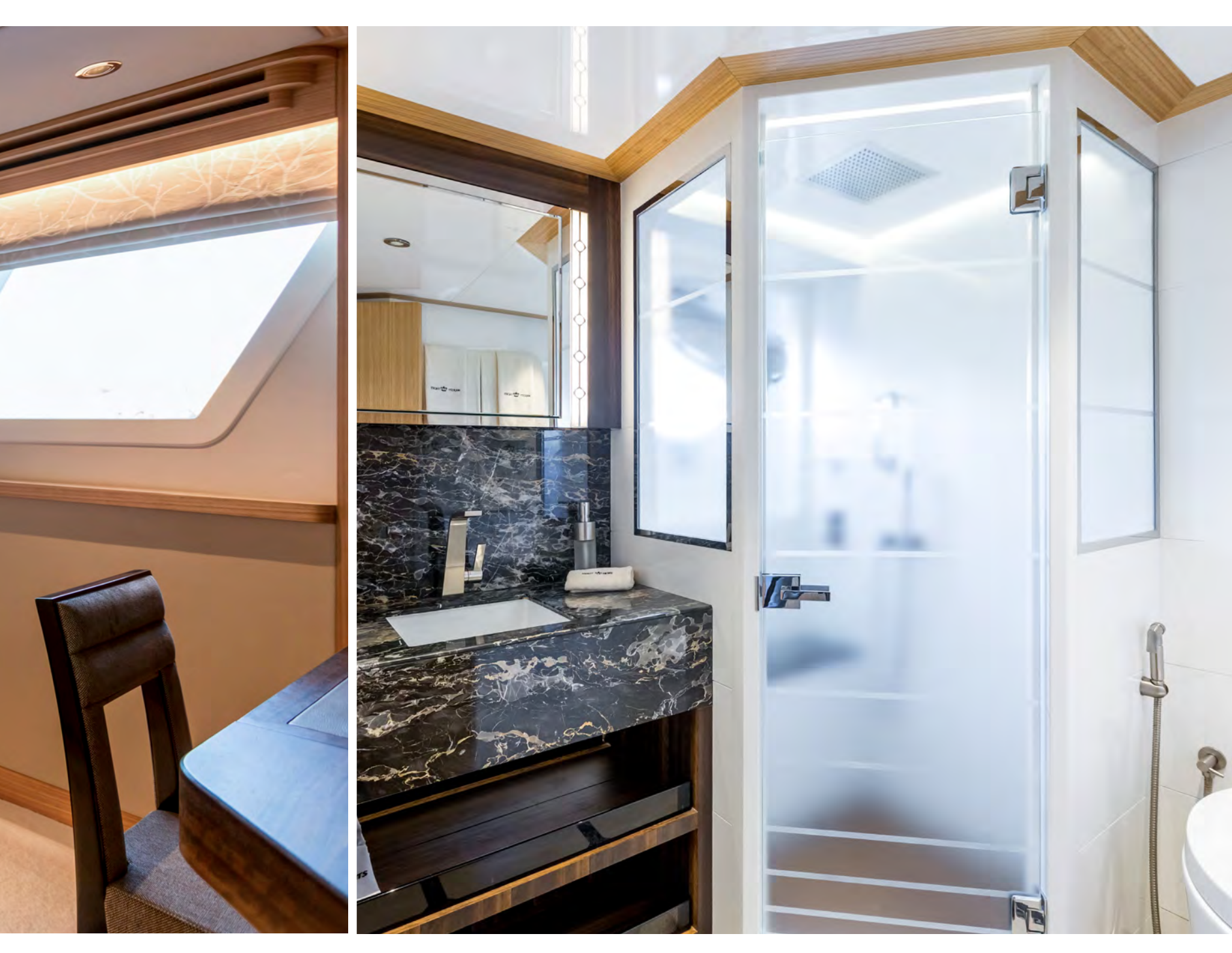
Double Guest En Suite