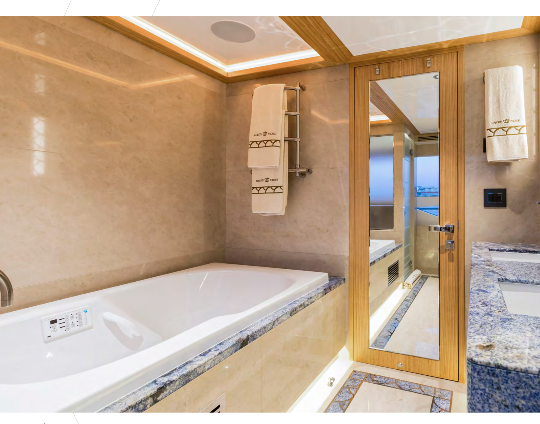
Owner's En Suite