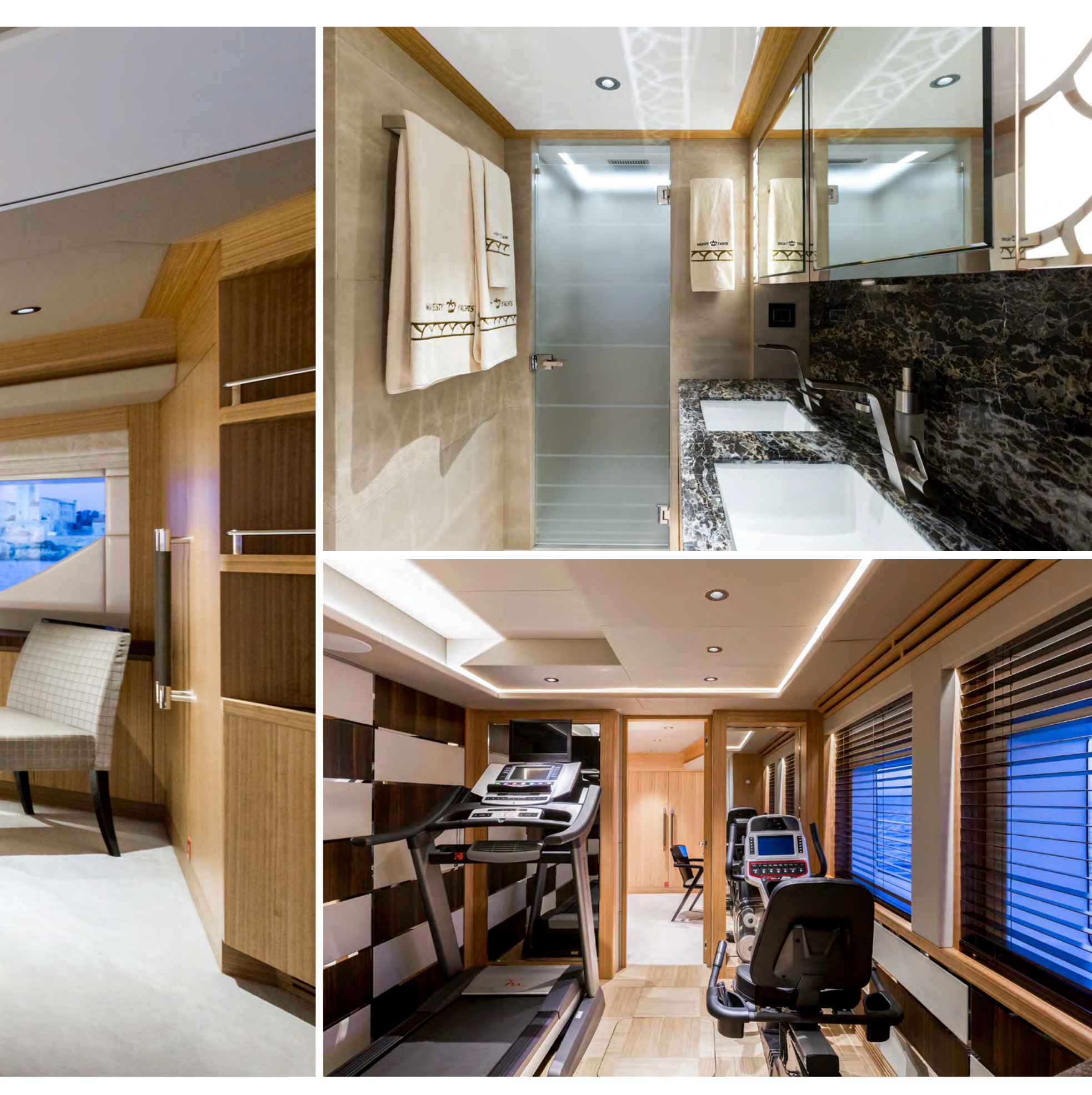
Top. VIP En Suite | Bottom. Gym