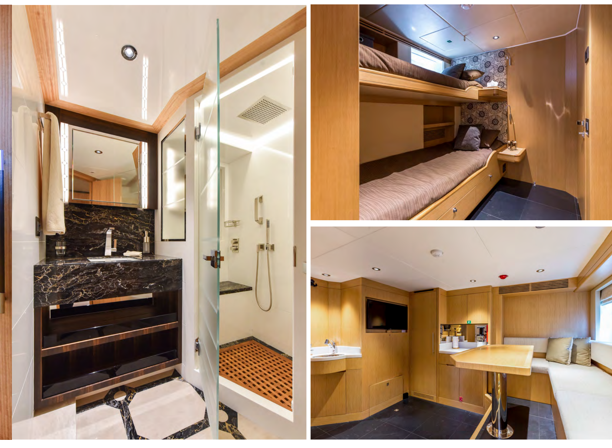
Top. Crew Cabin | Bottom. Crew Quarters