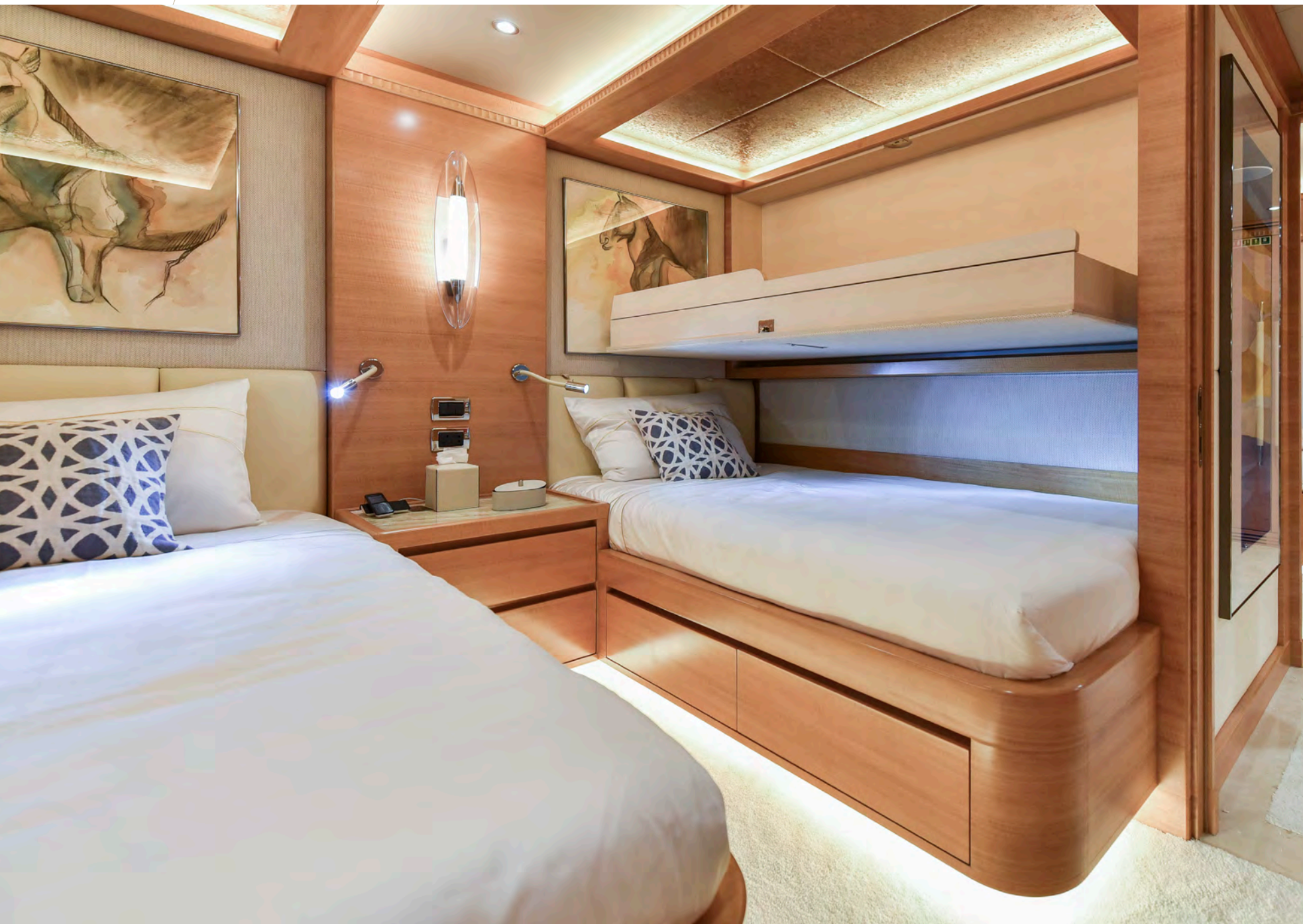
Twin Guest Stateroom