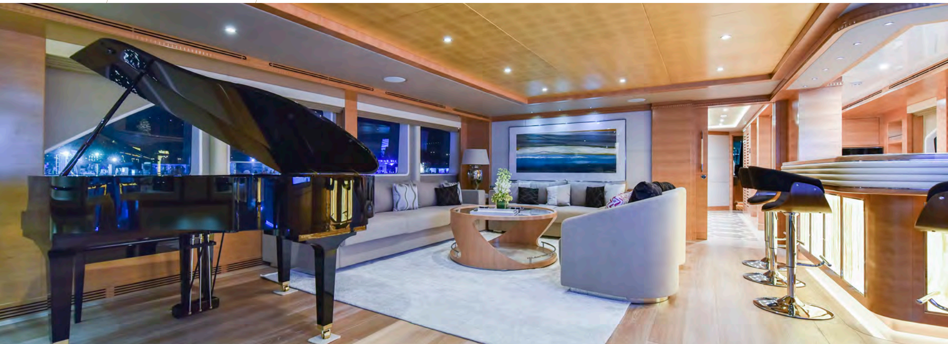
Upper Deck Saloon