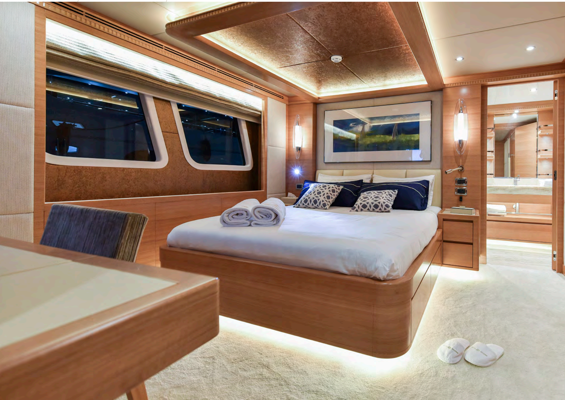
Double Guest Stateroom