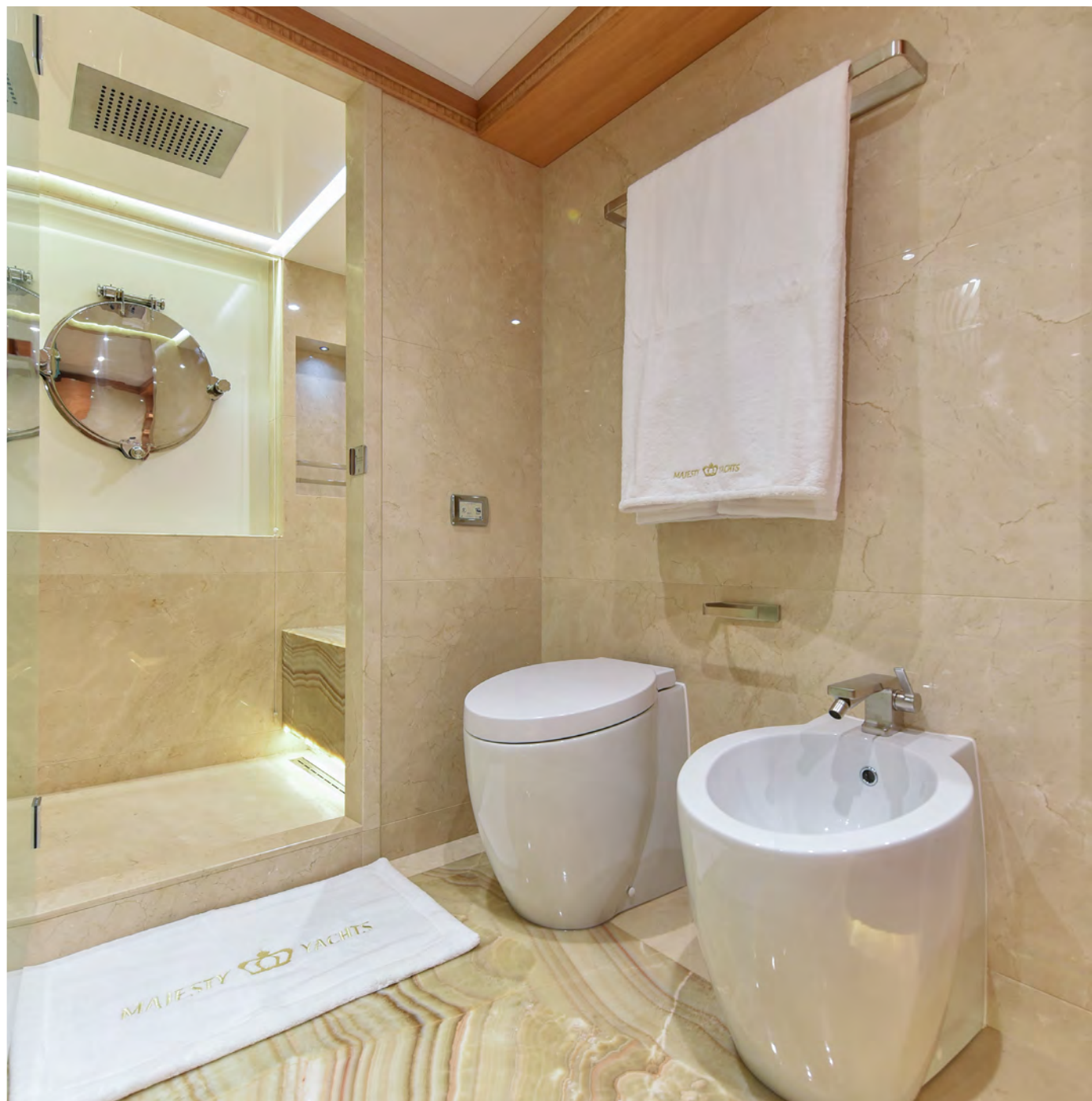
Twin Guest En Suite