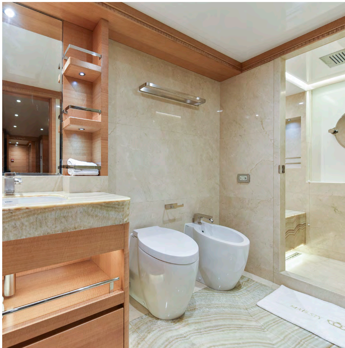
Double Guest En Suite