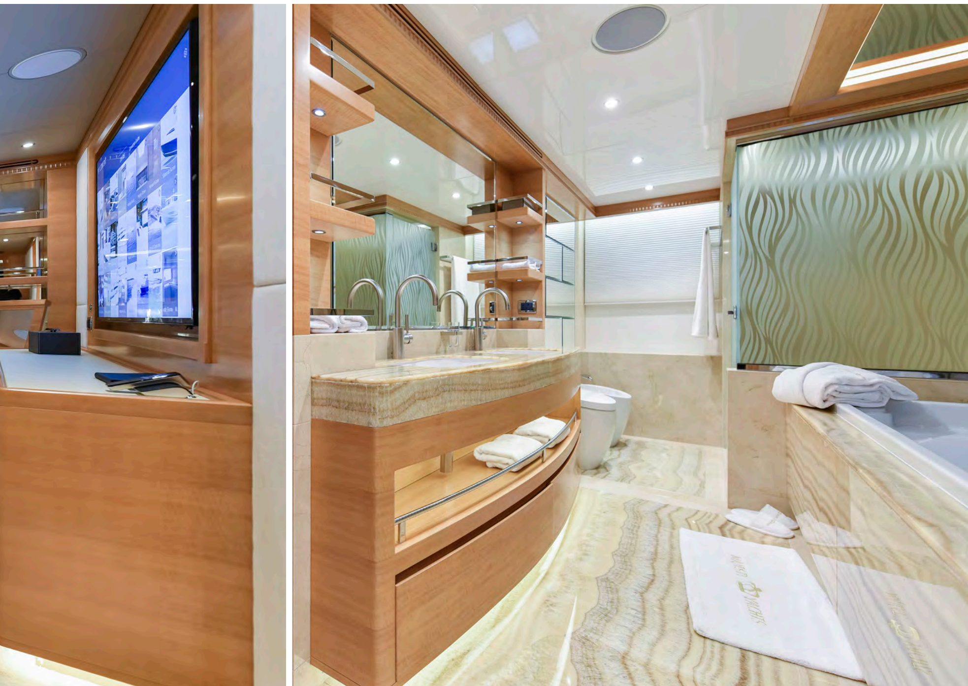
Owner's En Suite

This spectacular superyacht has six staterooms for 14 overnight guests with ample room for both spending quality time with your guests and for taking longer private trips. The Majesty 135 also includes additional cabins to accommodate five crew members.