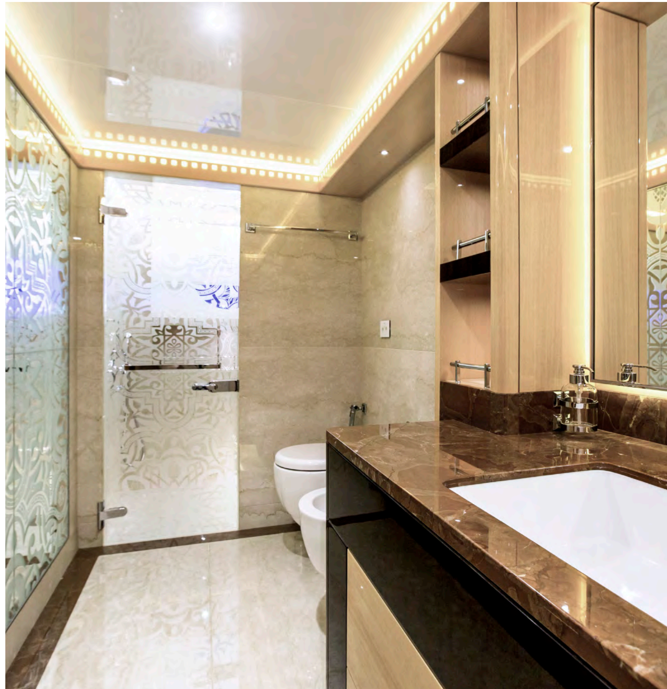
Double Guest En Suite

The 47m superyacht, Majesty 155, offers unequivocal luxury, with six expansive stateroom that can sleep up to 14 guests. While an elevator that carries guests between the lower, main, and upper decks offers added onboard convenience.