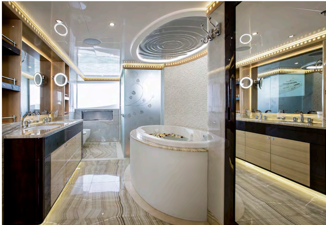
Top . Owner's Seating | Bottom . Owner's En Suite