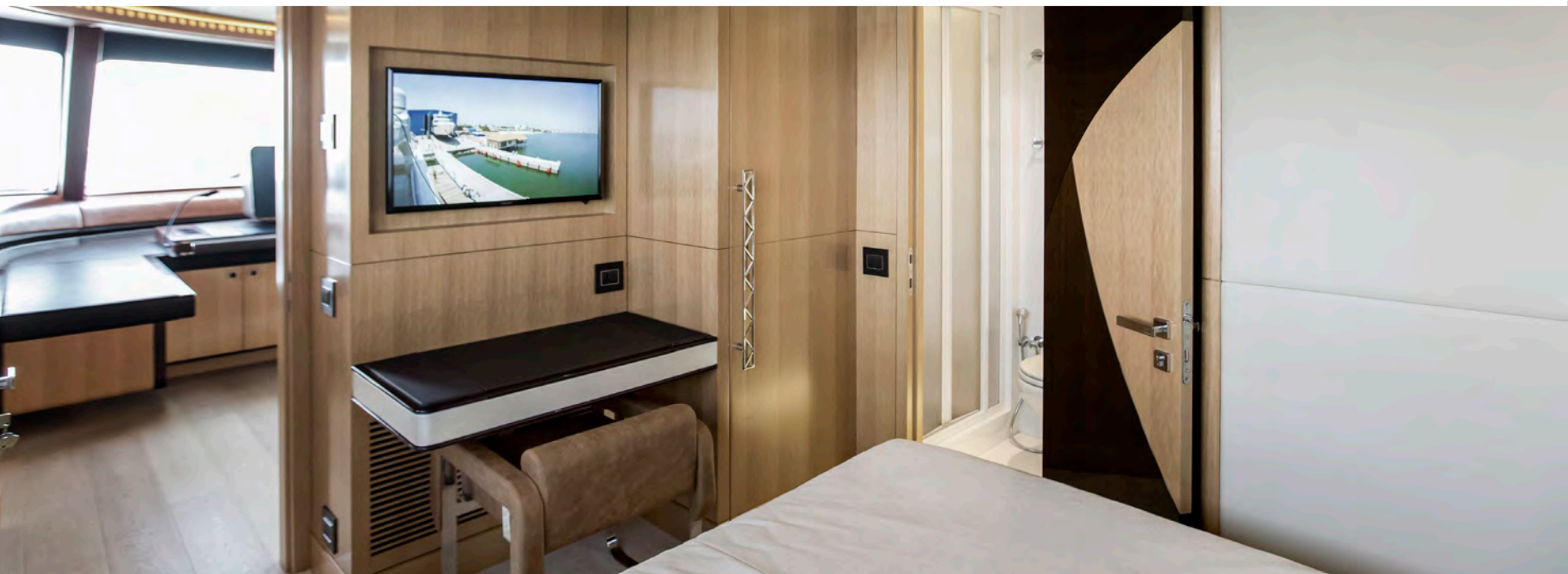
Top . Upper Deck Saloon | Bottom . Captain's Cabin