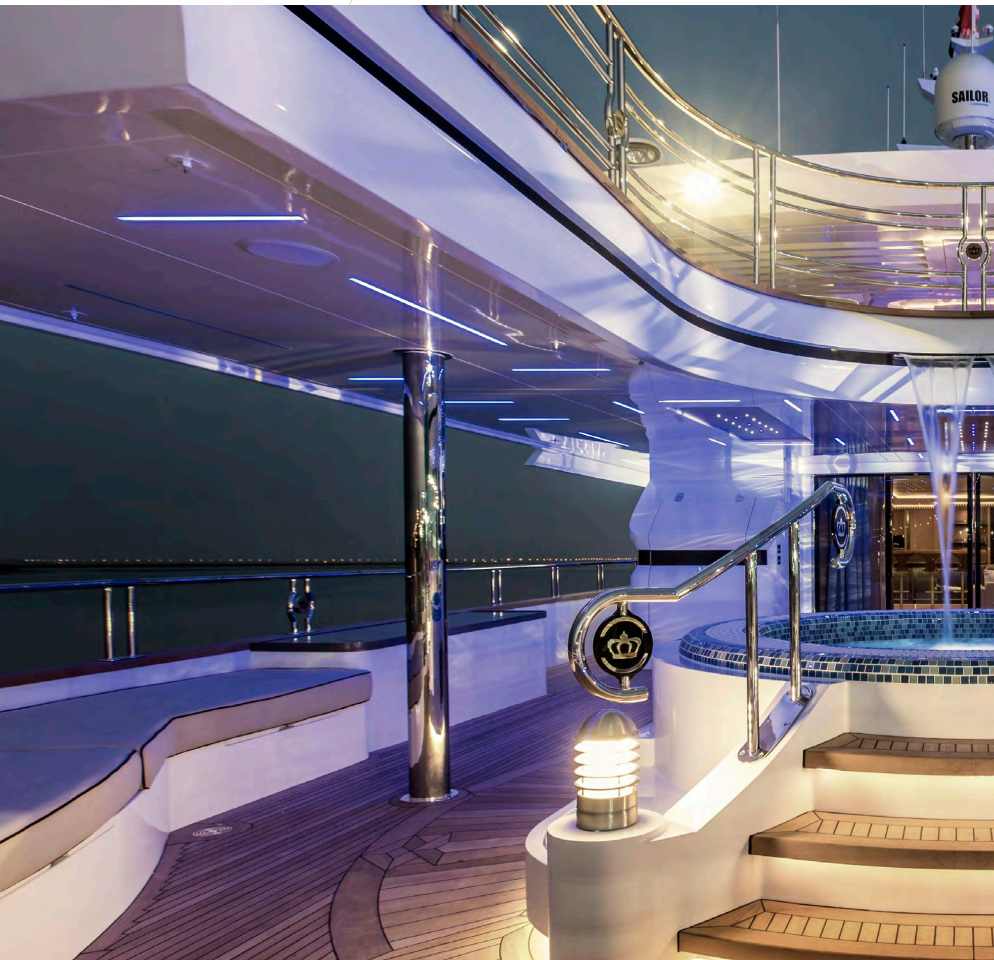
Upper Deck Waterfall