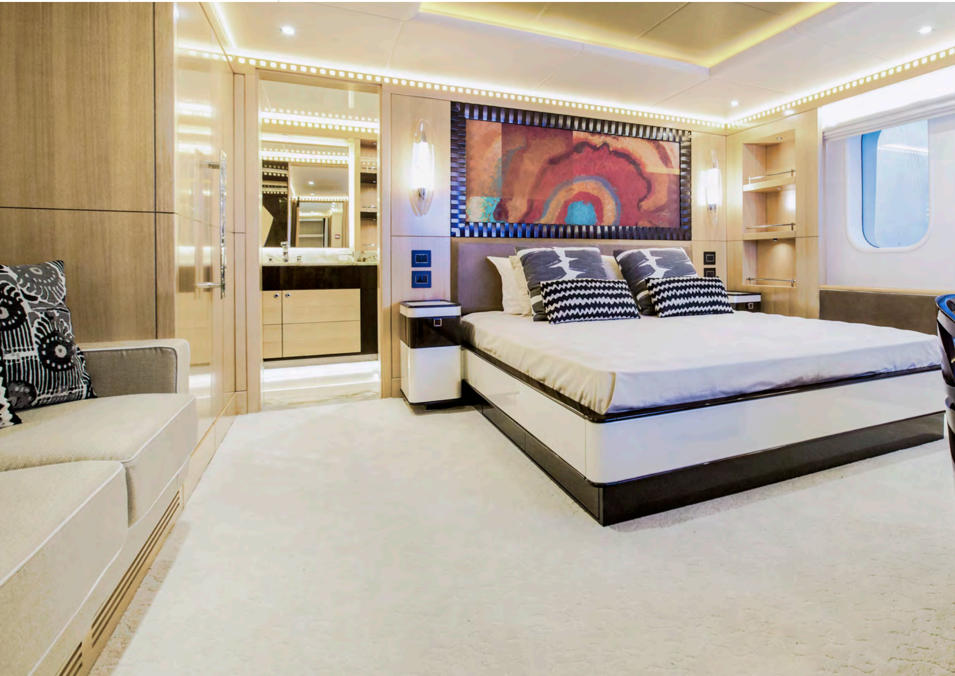
Double Guest Stateroom