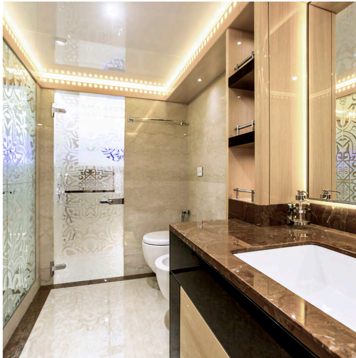
Double Guest En Suite

The 47m superyacht, Majesty 155, offers unequivocal luxury, with six expansive stateroom that can sleep up to 14 guests. While an elevator that carries guests between the lower, main, and upper decks offers added onboard convenience.