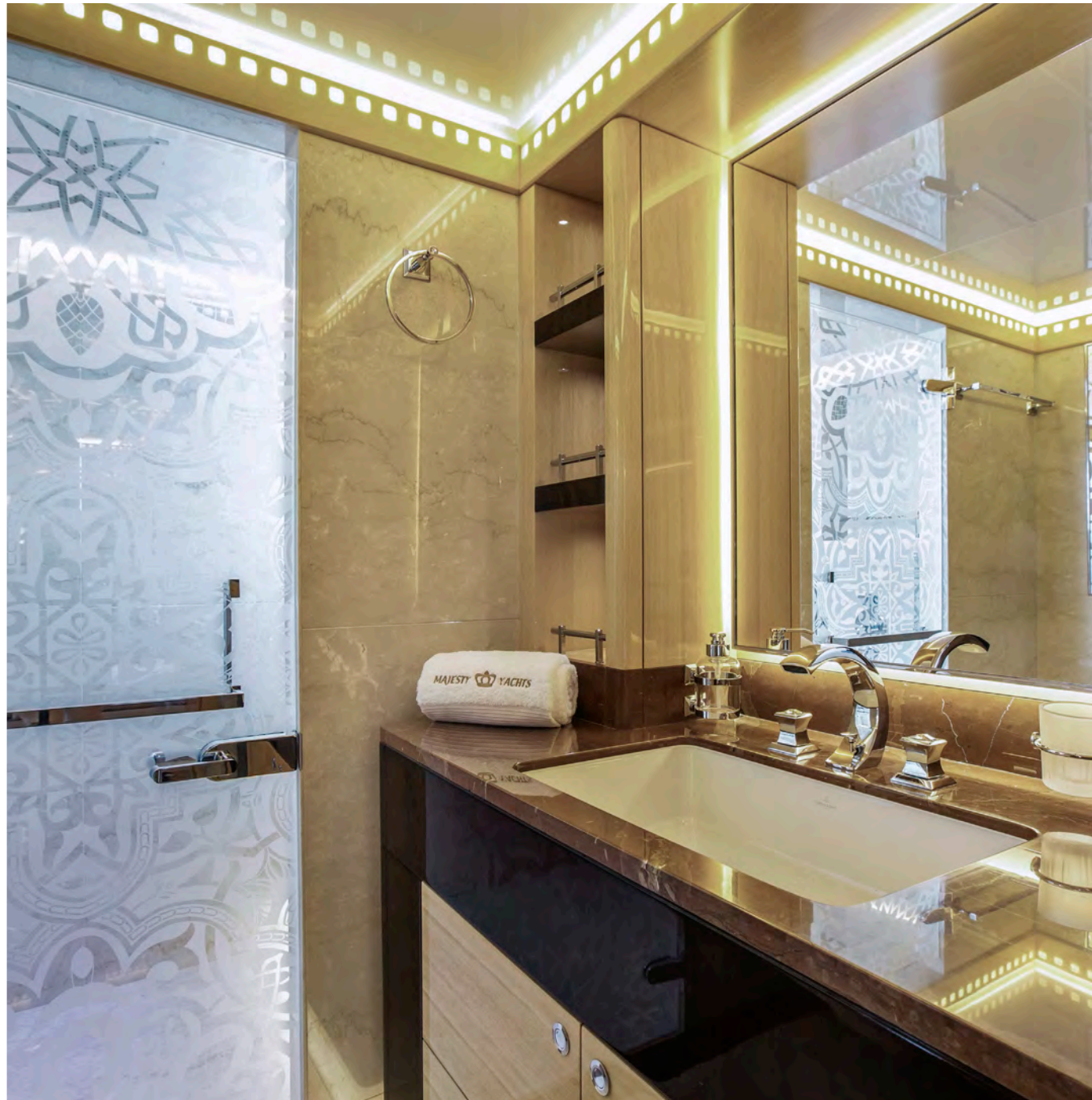
Twin Guest En Suite