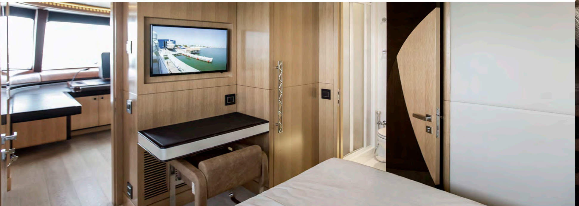
Top . Upper Deck Saloon | Bottom . Captain's Cabin