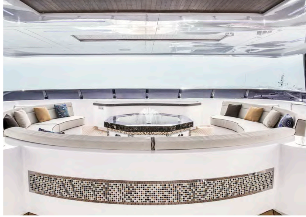
Sun Deck Seating