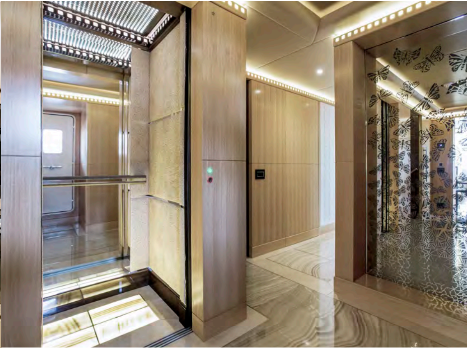
Main Lobby - Elevator