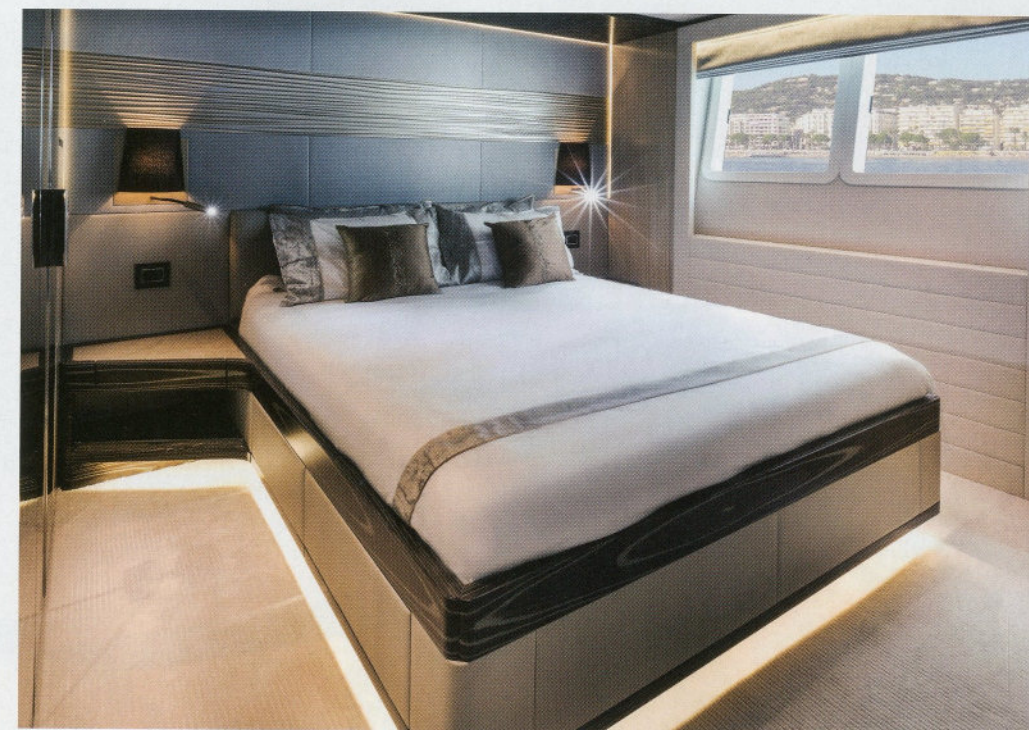
V-drive propulsion creates additional volume below, resulting in five guest cabins, plus the on-deck owner's suite.

The effort expended by Gulf Craft on their new 100 is an indication of what Bamps reports is a recovering demand for entry level superyachts, both from new millennials and existing clients—this unit, christened MY Nahar—going to a client on his second delivery from the shipyard. With this yacht Gulf Craft have incorporated ample interior and exterior areas for relaxation, with one often flowing directly into the other. The flybridge is certain this model's piece de resistance, offering a wet bar, electric barbecue, and even an optional Jacuzzi, it provides guests both a unique experience and versatility. With this new Majesty 100 this powerhouse shipyard from the Emirates has once again delivered a truly royal yachting experience. Long may it reign.