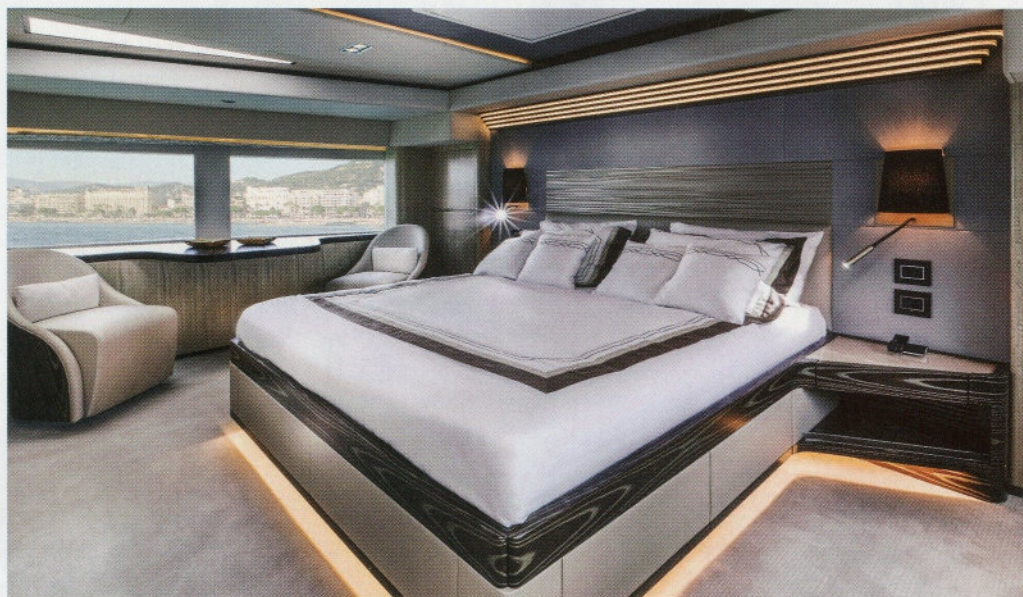
The master stateroom and en-suite demonstrate Majesty's determination to utilize only high quality materials and fittings.

apparent in the top speed, but also in an extensive range in excess of 1,500-miles when operating at displacement speeds."