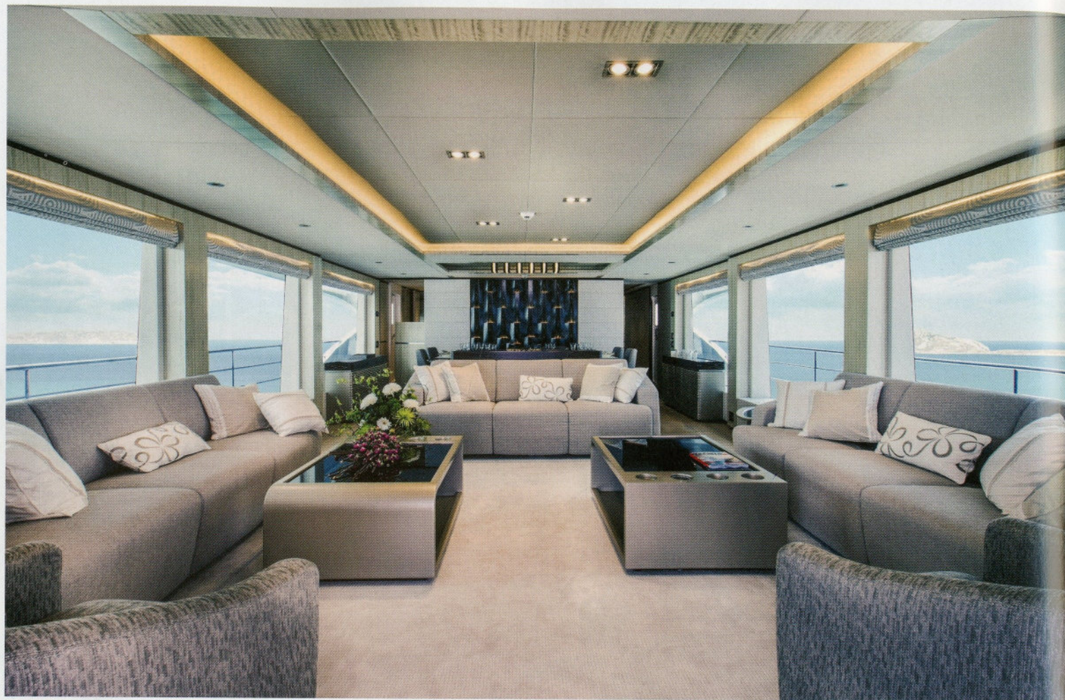
Floor to ceiling glazing in the main salon ensures guests aboard the Majesty 100 remain entirely immersed in their cruising environment, even when indoors.